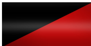
Magnetic Red with Black Roof