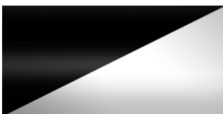
Pearl White with Black Roof

Nissan Philippines, Inc. reserves the right to alter, delete, or enhance features and specifications without prior notice depending on market requirements.