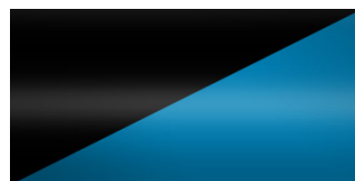
Magnetic Blue with Black Roof